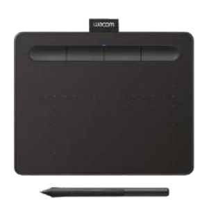
Wacom Drawing Pad