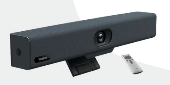
Yealink UVC40 Conference Camera

Furthermore, we have recently installed high-quality 4K resolution overhead conference cameras in each of our classrooms. Whether a student joins the centre face to face, or online through our learning platform Spark *, we want to give all of our students the best opportunity to learn. Through these conference cameras, online students are able to view the lesson in high definition just like face-to-face students, they can interact with the tutors in live lessons, and even access our resources through Spark *.