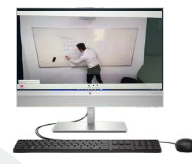
Touch Screen PC