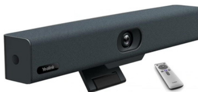
4K Conference Cameras