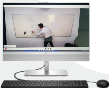
Touch Screen PCs

Furthermore, we have recently installed high-quality 4K resolution overhead conference cameras in each of our classrooms. Whether a student joins the centre face to face, or online through our learning platform Spark* , we want to give all of our students the best opportunity to learn. Through these conference cameras, online students are able to view the lesson in high definition just like face-to-face students, they can interact with the tutors in live lessons, and even access our resources through Spark* .