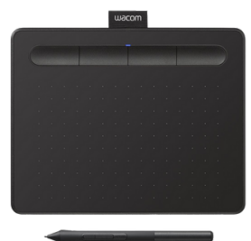
Wacom Drawing Pads